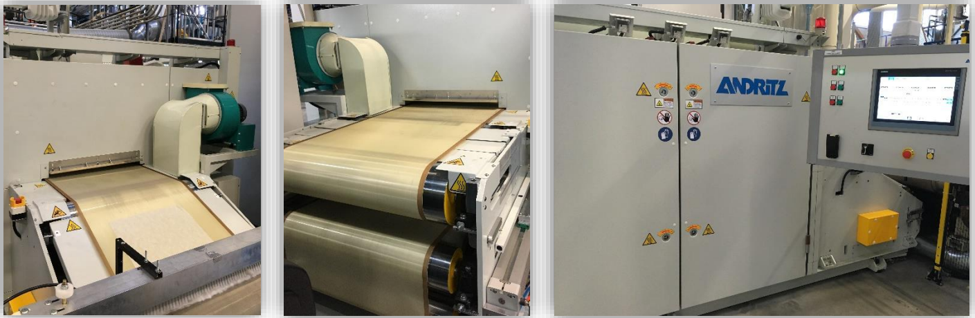
Entrance, exit and side view of the equipment