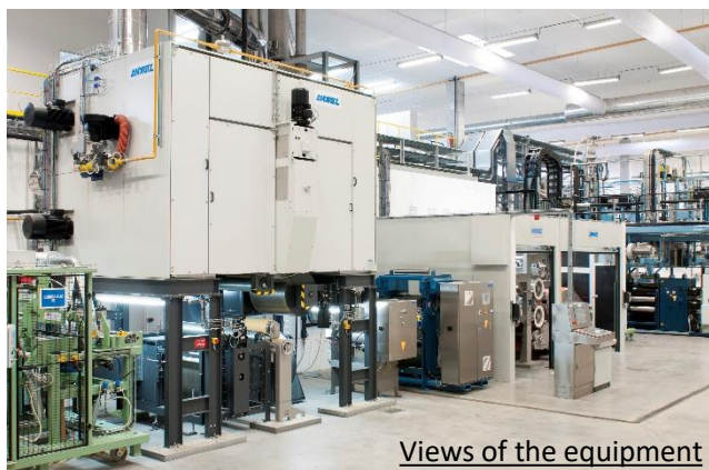
Views of the equipment