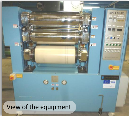
View of the equipment